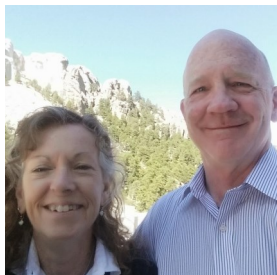
March 2016 Members of the Quarter

“Join us. The dinner presentations and ensuing conversations are more than worth the cost.”